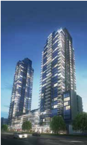
ME & ME 2

From 1955, the company evolved into what is today one of Toronto's premiere residential builder. From striving to reach ever-higher standards of quality to raising the bar on design and construction to its focus on providing outstanding property management services, Lash is committed to leading never following. Over the years, the company has prided itself on its vision to see future potential in untapped neighbourhoods both in the GTA and in Florida. With its insightful ability for creating unique, inspired condominium lifestyles, the company today is proud to introduce its newest addition to the Markham and Ellesmere intersection Tricycle. The third phase of the me Living community, Tricycle is improving on the extremely high standard established by its sister buildings. One need only to look at the many renowned condominium communities across Greater Toronto to see Lash's commitment for establishing lasting value in its condominium residences.