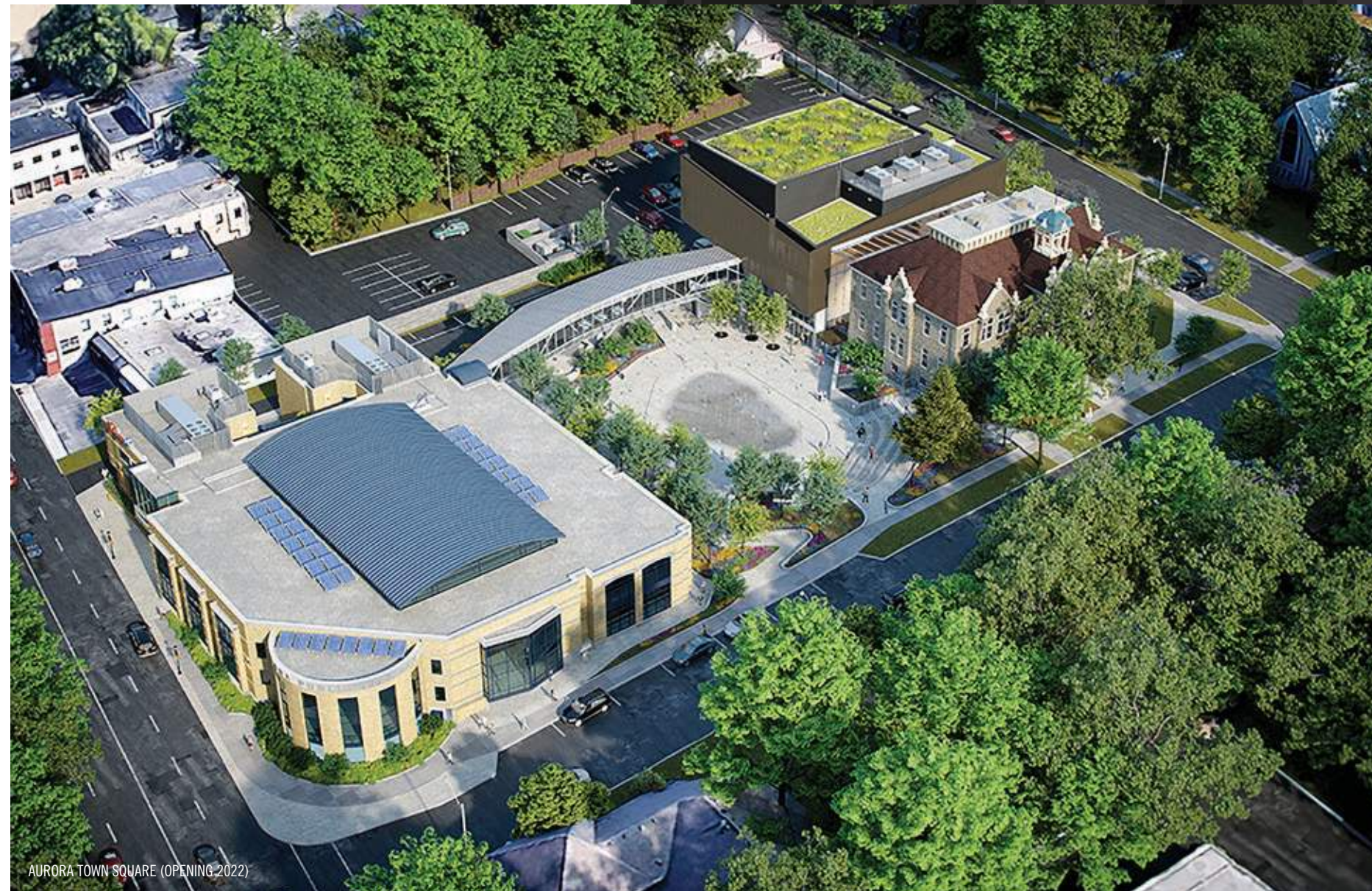
AURORA TOWN SQUARE (OPENING 2022)

Appreciation of such a rich Canadian history while continuing to inspire and elevate the lifestyle of each resident and visitor alike, it's no secret as to why Aurora is regarded as both an idyllic and thrilling place to call home.