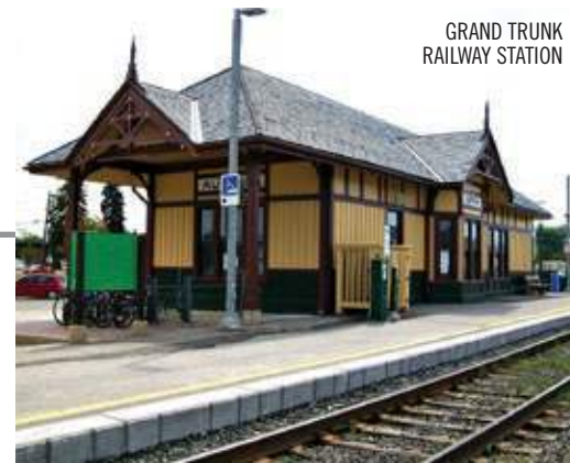
GRAND TRUNK RAILWAY STATION