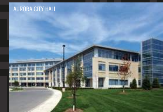
AURORA CITY HALL