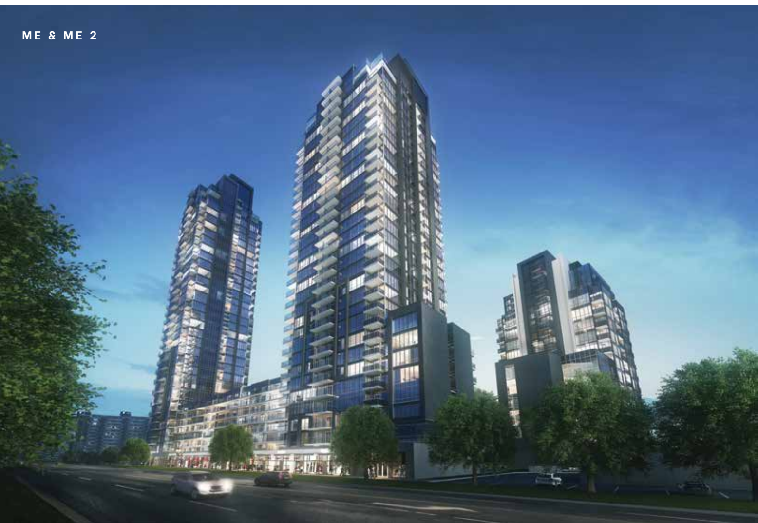
ME & ME 2