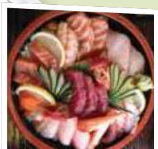
Ichiki Japanese & Thai