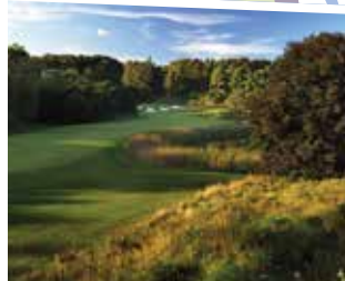
The National Golf Club of Canada