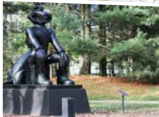
McMichael Canadian Art Collection