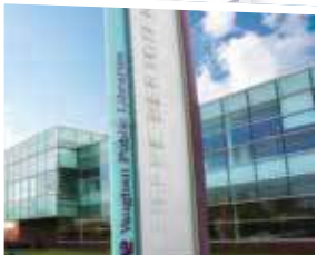
Pierre Berton Resource Library